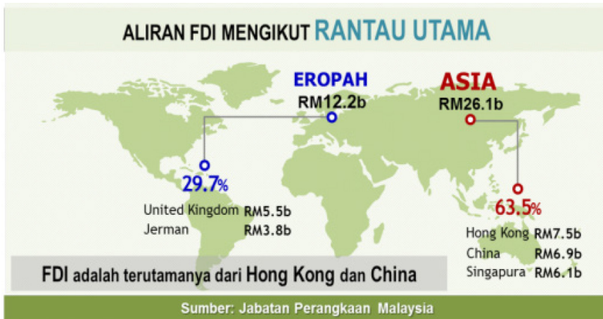
Figure 1: The flow of foreign direct investments into main regions of the world. Most FDIs in Southeast Asia come from Hong Kong and China.