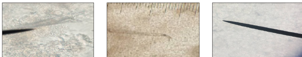
Figure 3: The nematode parasite has two spicules at tail, the parasites found has one split end, which is similar to the description of Camallanidae (scale bar 0.05mm)