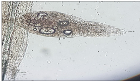
Figure 4: Circled is the frontal filament of L. branchialis . Abbreviations: c, cephalothorax; L1, first swimming leg; L2, second swimming leg; L3, third swimming leg; gs, genital segment; cr, caudal rami (scale bar 0.15mm)

the host's gills. The species is readily diagnosed according to the following features: the cephalothorax has a pair of antennules, which the antennules are four-segmented; a pair of antennae present, at ventrally and posterior of the antennules; the buccal tube is present posterior to the antennae. The copepodid has a frontal filament, which is different compared to other siphonostomatid parasites. Its frontal filament diverges into two when penetrates the host's tissue. While the body of L. branchialis consists of four pairs of swimming legs, six thoracic somite, included genital segment, and lastly its caudal rami (Brooker, 2007).